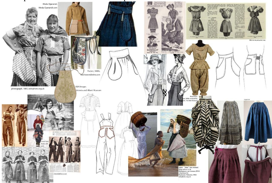
Fig.1 Archive Research

By visiting the Victoria and Albert Museum (London) and the British Museum (London) several times, the study have the chance to deeply research and observe the visual records and archive clothing of the early British sea wife. Noticeably, these vintage sea wife dresses were unique in that they often had double, striped, thick cotton skirts, the inner layer was widely used in order to keep out the damp, cold sea air. And the outer layer of the skirt was used to make room for pockets which can carry the fish and prawns that was later to be sold and the money that was earned. Additionally, some sawyers tied small flat pockets around the waist and this "U-shaped pocket structure was often seen on aprons"[2], trousers and other clothing from the early 1900s to the present day. In order to use the structure of trousers to separate different items, some fishermen tied a rope in the middle of their pockets and divided it into two parts.