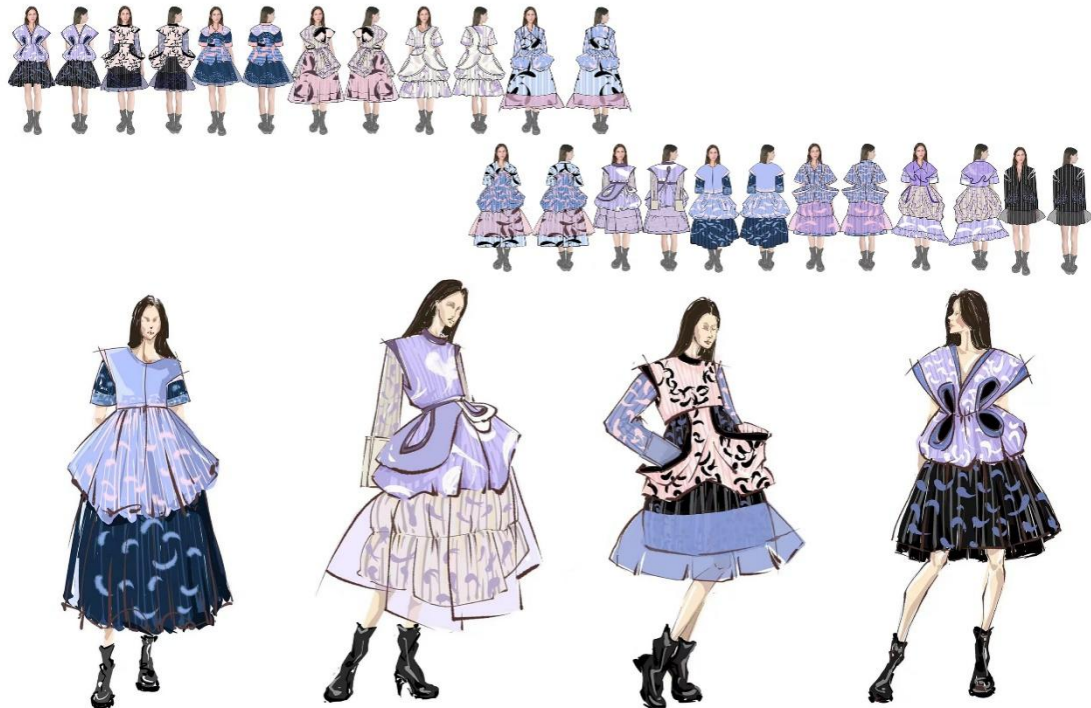
Figure 4. Completely detailed clothing designs