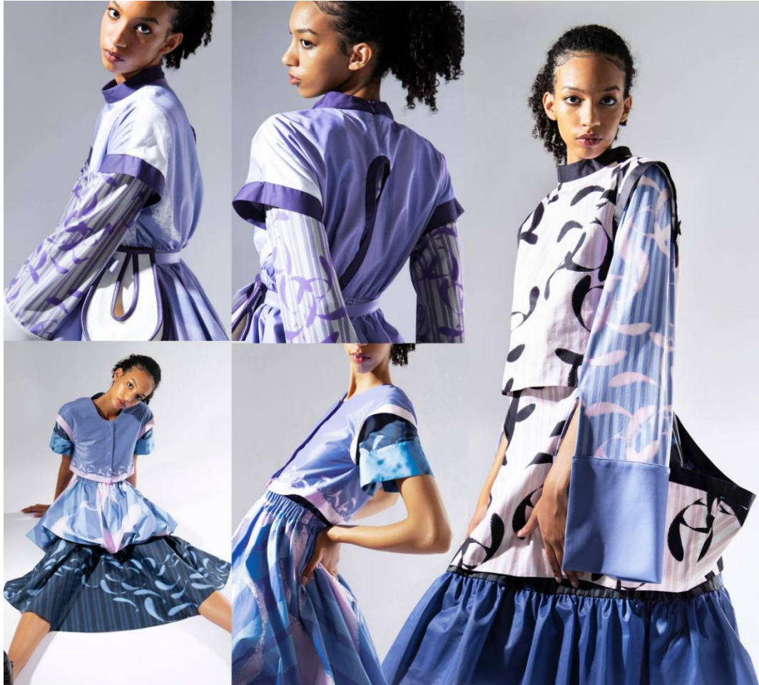
Fig.6 Garment Series Photography

Alternatively, this subject did a good job in the appearance of real archive garment pocket construction and derivative design others, and the designer have achieved successful print results when compiling 2D materials later.