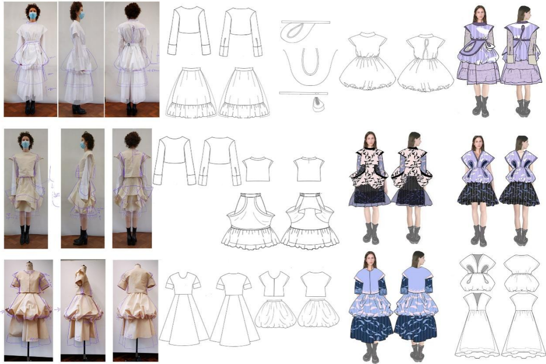
Figure 5. Project garment series

Specifically, speaking of the last design dress, in order to make the printing render well on the clothes, it used the drawing software to draw and cut the position of the pattern on the printing on the computer in advance, and it also left some fabric margin. It reordered two pieces of cloth, which were not large enough in shape, size and length to give a more complete final result. Later, this design would try to combine these printing, patterns and other materials, such as flocking transparent fabric, laminated laser fabric, combining printing with structure, etc. To sum up, when formulating clothing projects, designers should more fully consider the possible difficulties and problems, test fabrics, fabrics and pattern combinations in more types and forms, and study and design process details at the early stage of the design process in the process of clothing selection, so as to finally complete the clothing with good overall effect. The project should also keep more detailed notes and worksheets all the time, and finally adjust them as the project progresses.