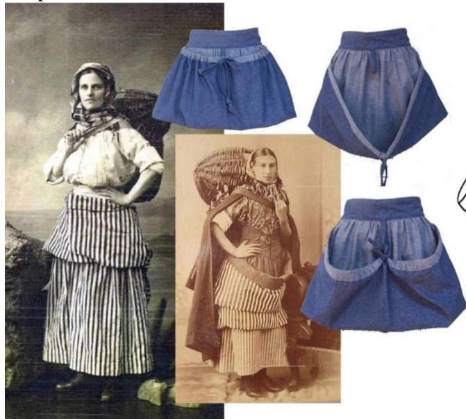
Fig.2 Pocket Research

variety of structures, details and components of clothing. A variety of ways in which the pocket structure was combined in the garment gave me much inspiration to improve and change them in styles in the later research. Generally speaking, it is commonly acknowledged that pockets are very functional for people working in traditional crafts, which is still possible in modern women's work, and this is an important design element in this subject collection. These pockets and structures inspired the subject to learn how they were put together, combine them with the design ideas and experiment with garment construction on the mannequin, and from this experimentation the design developed some of this garment constructions, the combination of the pocket construction with the silhouette was the initial design idea, and the researchers of this article have drawn many designs using or combining different pocket constructions.